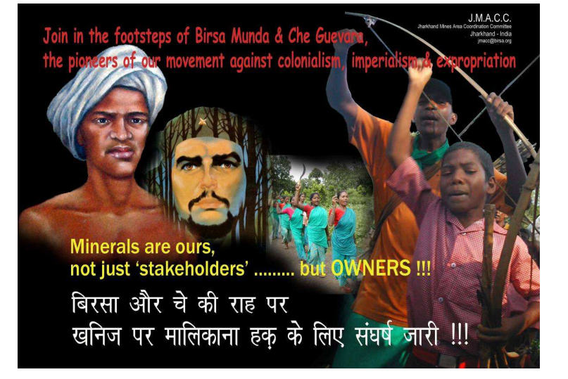
Simple, relevant and striking, the slogan helped trigger a change in the way the victims perceived their reality

The choice of language is a political one. By limiting the demands to fair compensation, one accepts the false claim that the mining companies are legally sanctioned and morally vindicated in their actions as long as the mandatory statutory compensation is paid.