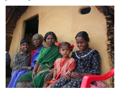
An Adivasi family relax outside their home in the Western Ghats, in the state of Karnataka, Western India

ers found it increasingly difficult to engage in dubious backdoor dealings with company bosses that left Adivasis landless and destitute. This reflected a seismic shift in the status quo. In the past the mining industry bribed local politicians, and their contracted henchmen, to keep locals in line, silencing any group's that complained too loudly. But the locals' rights could be denied no more, and thing were starting to change.